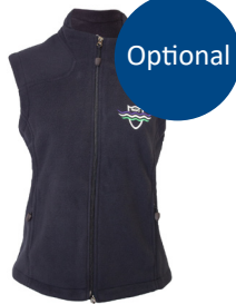
Polar Fleece Vest