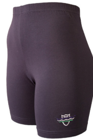
Sports Bike Short