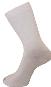
Sock Anklet 2 pkt