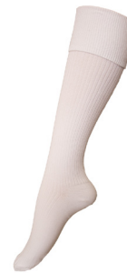
Sock Kneehigh 2 pkt