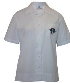
Blouse Short Sleeve