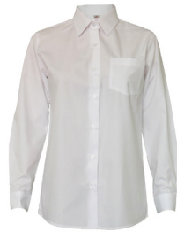
Blouse Long Sleeve